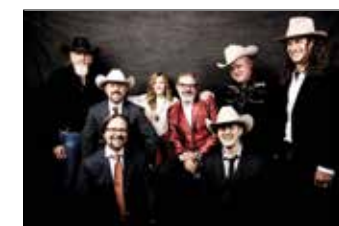
Asleep at the Wheel