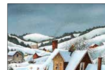
Eldridge Bagley, Gathering Mistletoe , 1983. Oil on canvas. Morris Museum of Art, Augusta, Georgia.