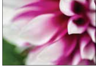
Elmore DeMott, Flowers for Mom II: November 1, 2017 . Digital media. Courtesy of the artist.