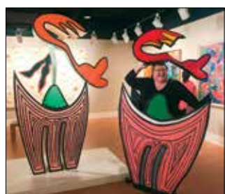
Morris Museum docent in costume.