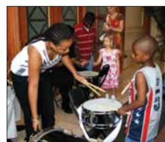
Symphony petting zoo