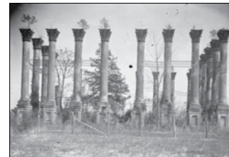
Windsor Castle Ruins, Port Gibson, Claiborne County, MS, photograph, 1933.