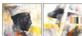
Charles Edward Williams, Side A + B , 2017. Oil on gessoed watercolor paper.