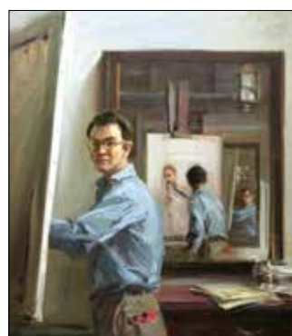
Everett Raymond Kinstler, Triple Self-Portrait , 1972. Oil on canvas, 40 x 34 inches. National Academy Museum, New York.