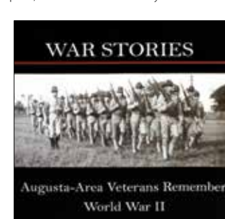
Augusta-Area Veterans Remember World War II