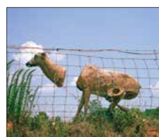
Clay Jordan, Untitled , 2016. Archival inkjet print, 20 x 20 inches.