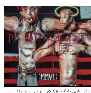
John Mellencamp, Battle of Angels, 2014. Mixed media on canvas.