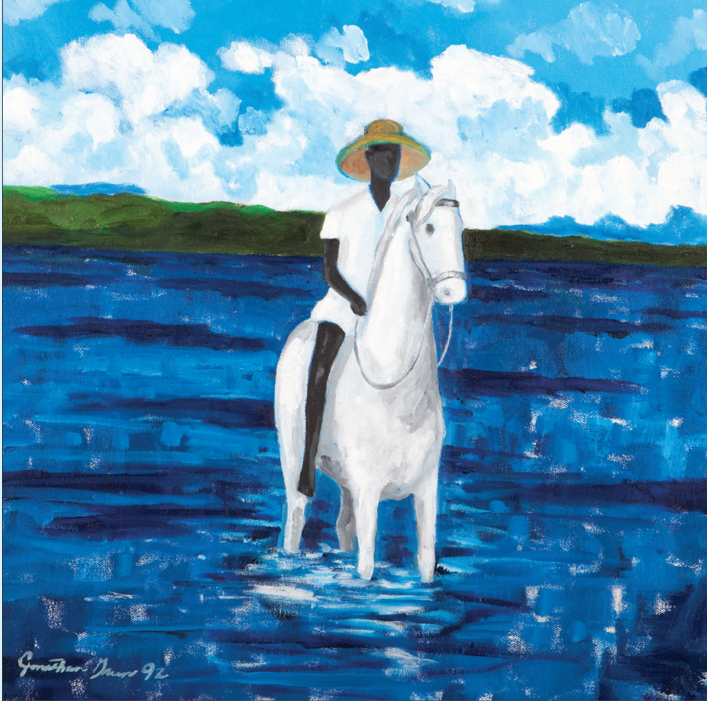
Jonathan Green, White Pony , 1992. Morris Museum of Art, Augusta, Georgia. Courtesy of the artist.